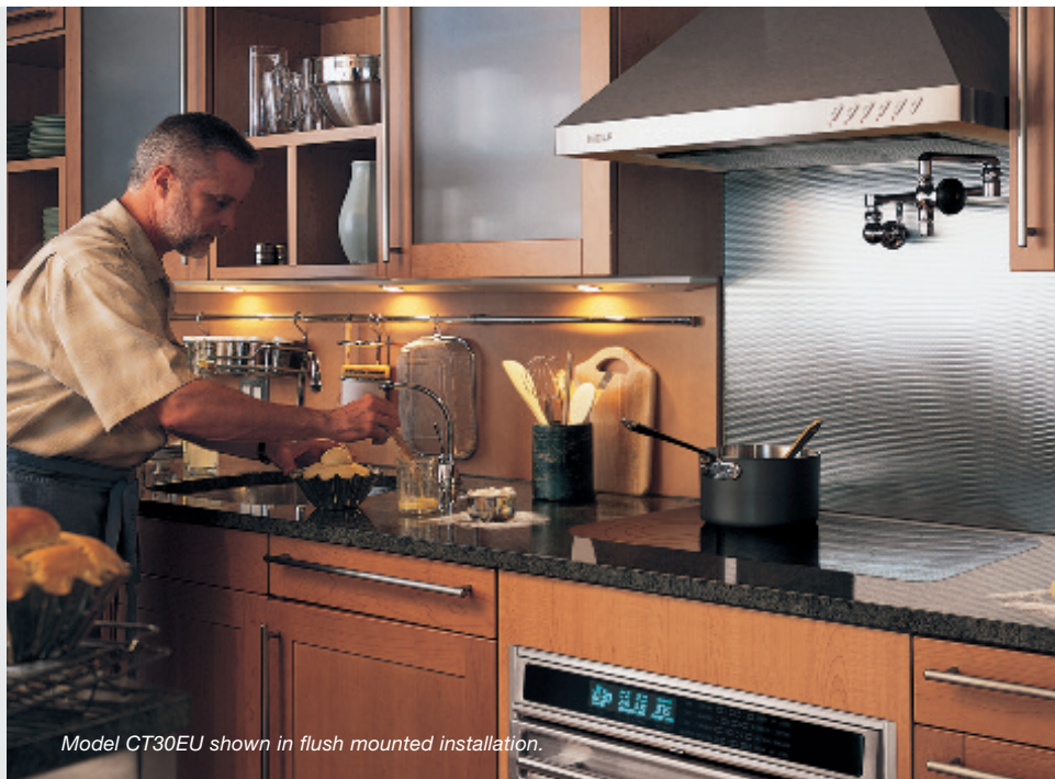
Model CT30EU shown in flush mounted installation.

With Wolf's unframed electric cooktops there's no stainless steel trim, just the sophisticated, minimalist exterior subtly patterned design to hide any unsightly scratches. Three heating elements with seven zones offer exceptional control of temperature for cooking utensils of every size. A bridge connects two elements for an 8-inch by 17-inch, 4400 watt heating area. All elements offer true simmer along with one element that enables you to set the temperature for melting.