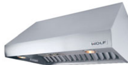
Model PW422418 Pro Wall Hood

Accessories are available through your Wolf dealer. To obtain local dealer information, visit the Showroom Locator section of our website, wolfappliance.com .