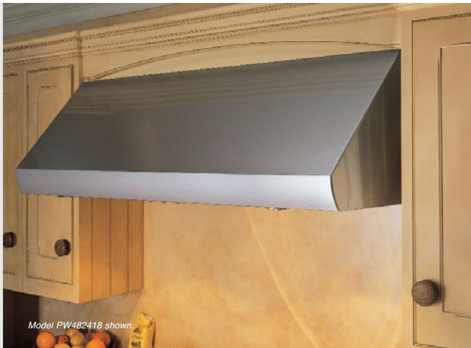
Model PW482418 shown.

With standard features like heat sentry and dual setting halogen lighting, Wolf Pro wall hoods provide the ultimate in ventilation. Pro 24" deep wall hoods are available in seven widths and all have the classic stainless steel finish. You also have the option of a decorative rail. While a classic stainless steel rail is standard on (R) models, platinum or brass rails are available to match the bezels of our dual fuel ranges and sealed burner rangetops.